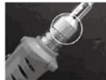
Blue flame in the hole

6.) Upon catalyst turning red, the unit is ready to use for solder or blower function. IF BLUE FLAME STILL APPEARS IN THE HOLE, remember to re-trigger again to stop blue flame appearing. Otherwise, it will make the soldering overheated in danger.