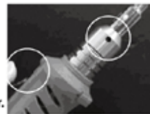
Re-trigger start to extinguish flame

3.) Turn the flame regulator from left (-) to right (+)